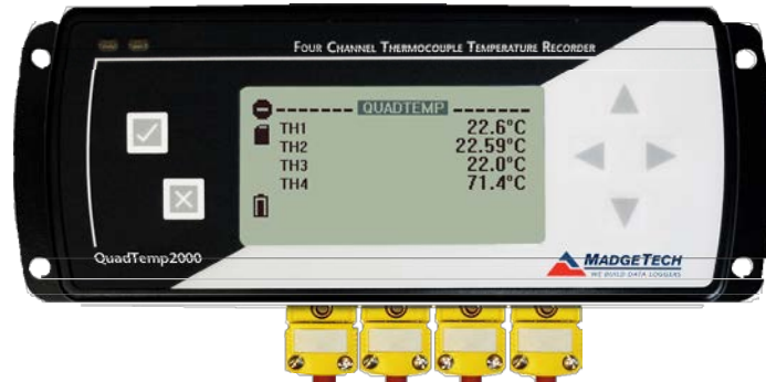
*Thermocouple Plugs/Probes Sold Separately

The QuadTemp2000 is a four channel thermocouple data logger with an LCD. The device features onscreen minimum, maximum and average statistics, as well as a user configurable graphics screen that allows for any combination of channels to be displayed. The device accepts J, K, T, E, R, S, B and N type thermocouples.