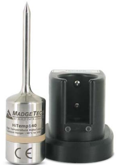
IFC400 ( sold separately )

Using the MadgeTech Software, starting, stopping and downloading the HiTemp140 is simple and easy. To use, simply place the HiTemp140 in the IFC400 or IFC406 docking station ( sold separately ). Using the software, an immediate or delay start can be chosen, as well as the reading rate. Start the data logger, remove it from the docking station and the device is ready to be deployed. Graphical, tabular and summary data is provided for analysis and data can be viewed in °C, °F, K or °R. The data can also be automatically exported to Excel® for further calculations.