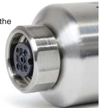
Closeup of the M12 Connector